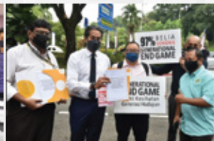
NCSM calls on MPs to support the Health Ministry's proposed Generational End Game Tobacco and Smoking Products Control Bill.