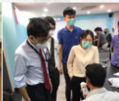
Community health screening programmes for medical students