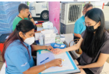
Jejak Kanser, a health screening programme in Jerantut, Pahang.