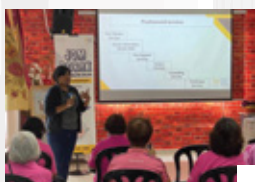
NCSM's psychosocial team held talks and engagement activities.