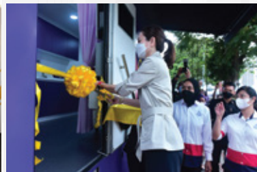
Launch of the National Mobile Health Screening Clinic, a collaboration with MCIS Life.