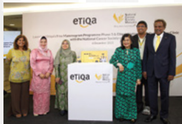
Launch of the National Mobile Health Screening Clinic, a collaboration with Etiqa.