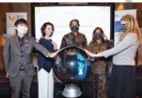
Launch of the BEAUTY and Health programme, a project to propagate cancer awareness to the community by using local beauty salons and barber shops.