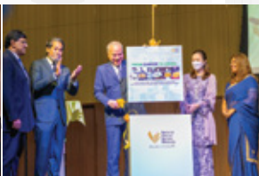
Launch of "From Cancer to Covid: How the National Cancer Society Malaysia Supported the Malaysian Covid-19 Vaccination Efforts" book.