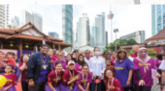
Relay for Life returns after a two-year hiatus.